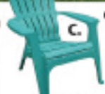
C. RealComfort® Adirondack Chair Reg.: $19.99 SALE: $17 99 *