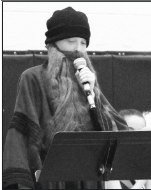
Fourth grade Key Students at South Range Elementary School held a had family and friends guessing who they were dressed as last week.