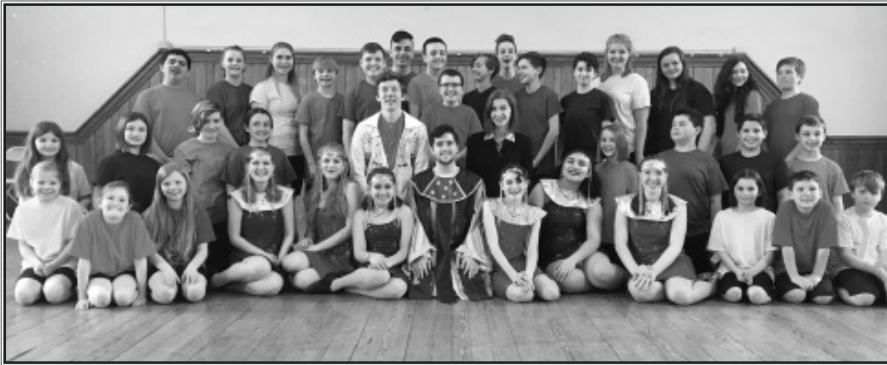
Joseph and the Amazing Technicolor Dreamcoat turns 50 this year and performers at the Kids Coop Theatre will be paying tribute to that with a performance starting on May 25.