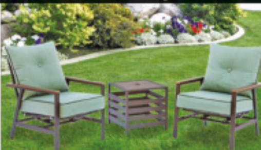
NAPA COLLECTION 3 piece, deep cushion chat set Reg.: $349.