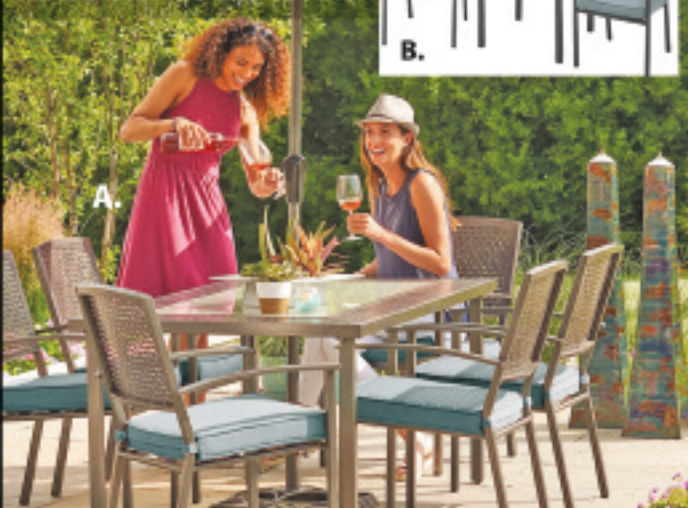
A. 7-Pc. Newport Dining Set Pewter-Finish Steel, 6 Cushioned, Stackable Chairs. Reg.: $599.00 (227450)