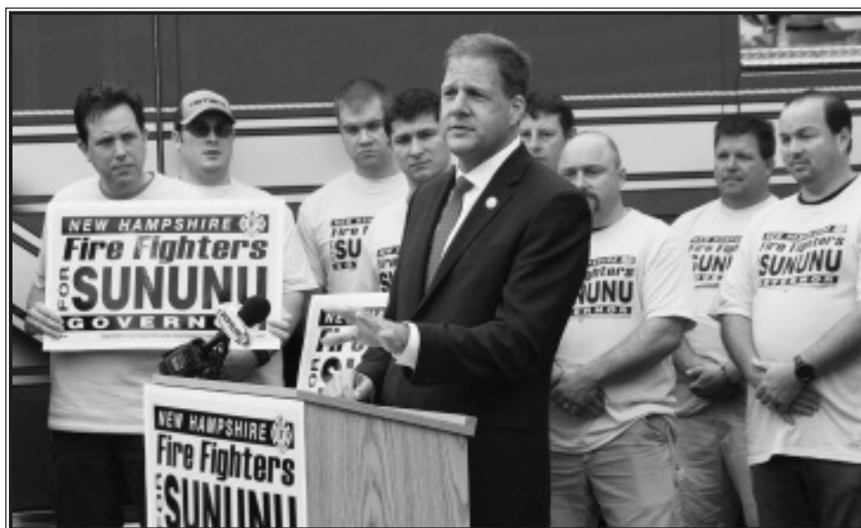
Governor Chris Sununu was surrounded by members of the Professional Fire Fighters of New Hampshire in Londonderry last week as they held a ceremony to endorse him at the North Fire Station.

Gov. Chris Sununu, who was surrounded by members of the PFFNH, said, "It is an honor to be here, and humbling to get the endorsement of the