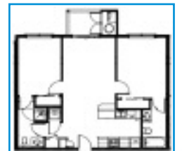
2 Bedroom Units