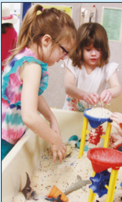
To help students get through some of the areas colder weeks of the year Moose Hill Kindergarten holds their annual 'Beach Day' where students come prepared for a number of fun beach-themed activities in each of the classrooms. Everything from examining sea creatures to surfing, building sand castles and just hanging out under an umbrella, was offered over the course of the morning and afternoon sessions.