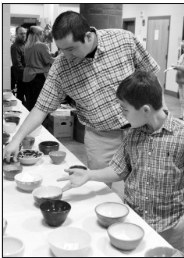
There will be plenty of handmade bowls to choose from during the annual Potters Bowl hosted by the Community Caregiver of Greater Derry.