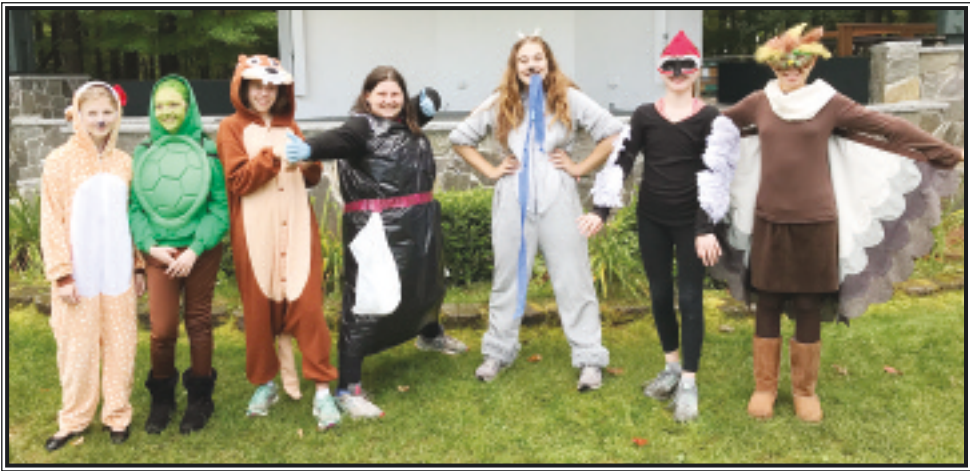
The Cadette Girl Scouts look to find sponsors to help realize a Storybook Creatures Walk through the Kent Allen Forest.