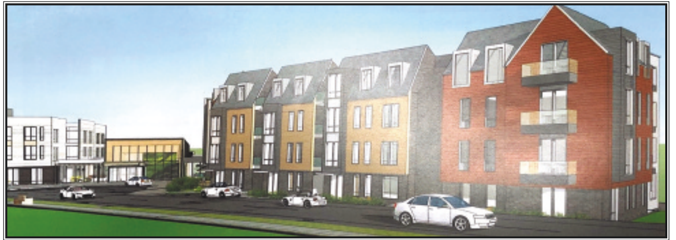
Rendering of the buildings being proposed to the Heritage Commission at Woodmont Commons.

There will be a glass enclosed raised walk through area that hovers over a main street so residents can stroll through and see outside areas without worries of diffi-