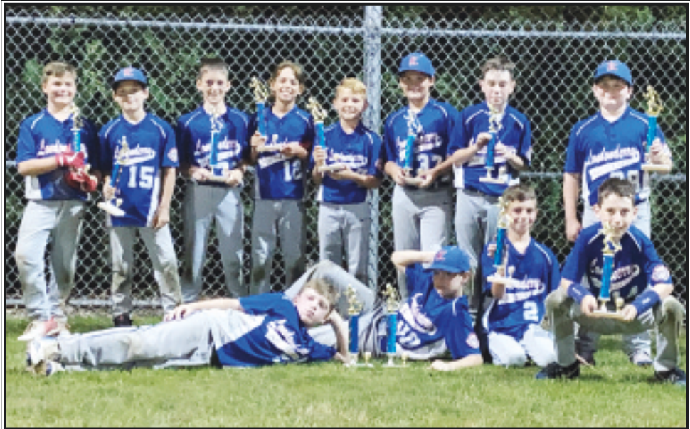
The 10U team had a 17-4 record over the summer, and reached the finals in all four tournaments they entered.