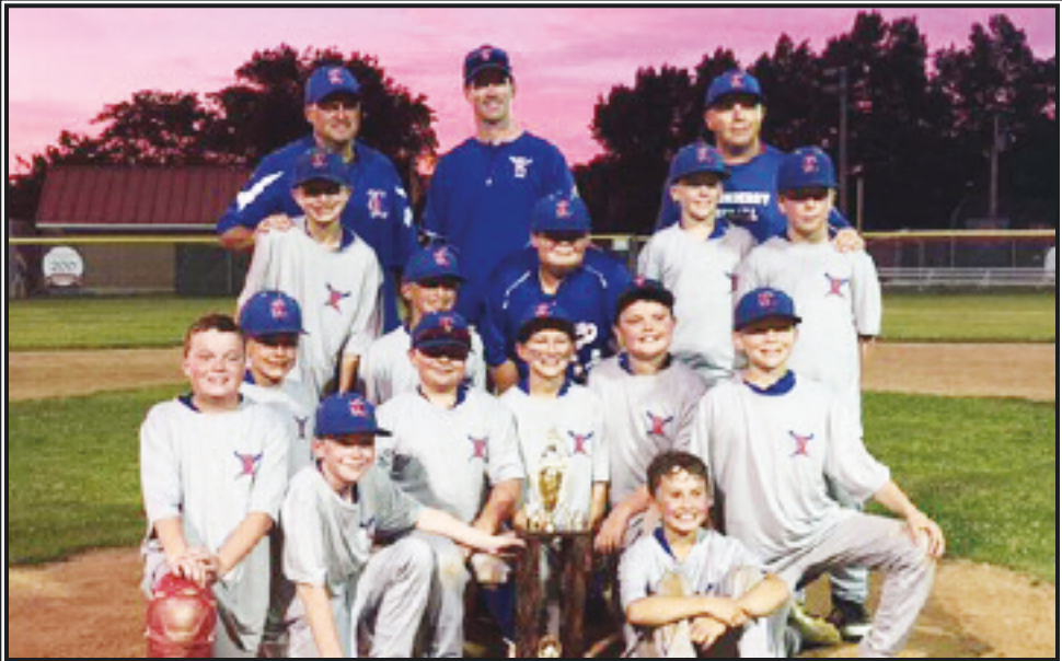
The 11U Londonderry All-Stars won its third straight Londonderry Invitational thanks with a 4-1 record and a 12-0 win over Windham in the finals.