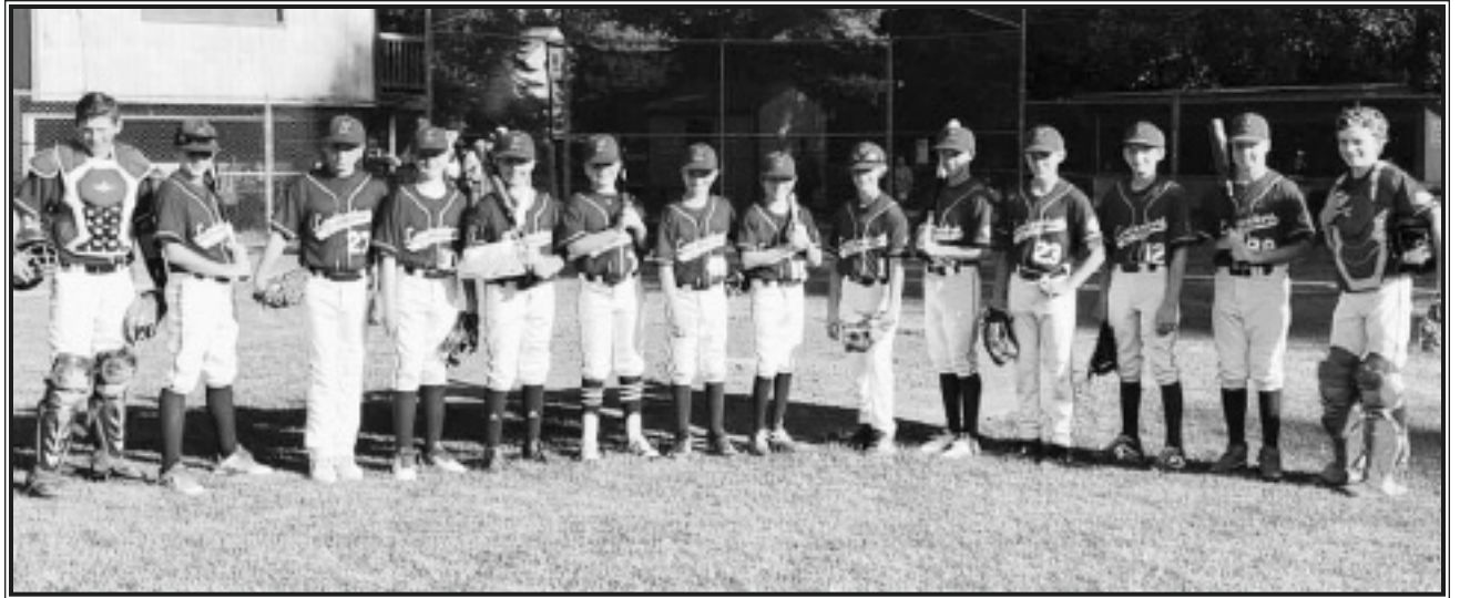
The Londonderry 12U All-Stars are on their way to Cooperstown, New York, to participate in a week-long baseball tournament.

The team later won its third straight Londonderry Invitational thanks to a 4-1 record and a 12-0 win over Windham in the