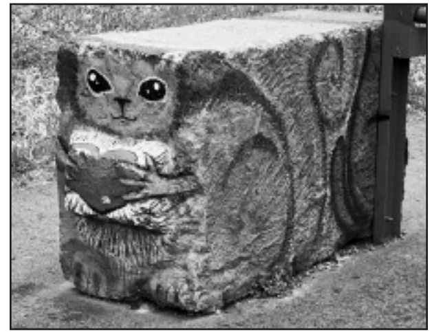
The Kindness Rocks Project is currently underway at the Derry Rail Trail and bringing colorful art to the walkways.