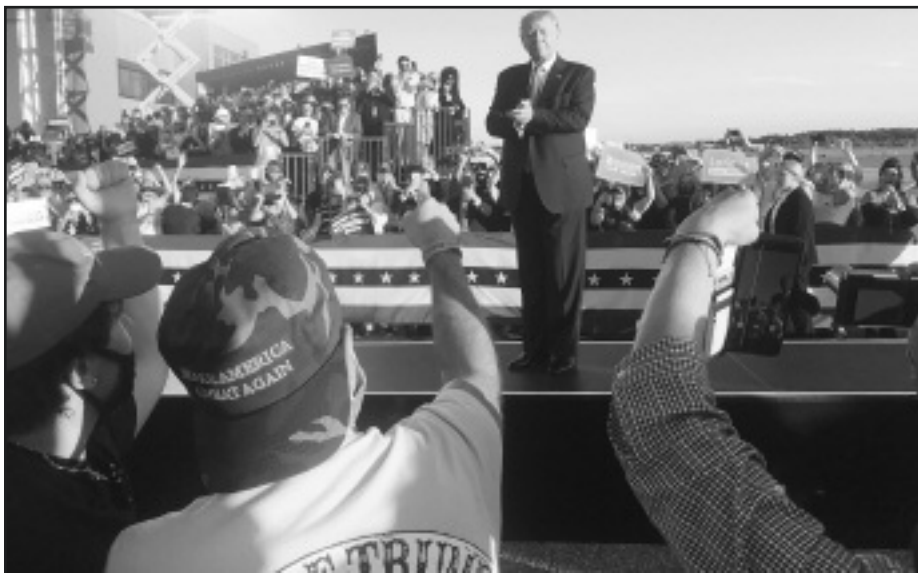
President Donald Trump greeted by supporters at the Manchester Boston Regional Airport during Friday's campaign rally.

Trump also talked about his accomplishments, "We've secured America's borders, brought back our manufacturing jobs, rebuilt the United States military, wiped out the Isis caliphate, killed our terrorist enemies, kept America out of foolish, stupid, ridiculous foreign