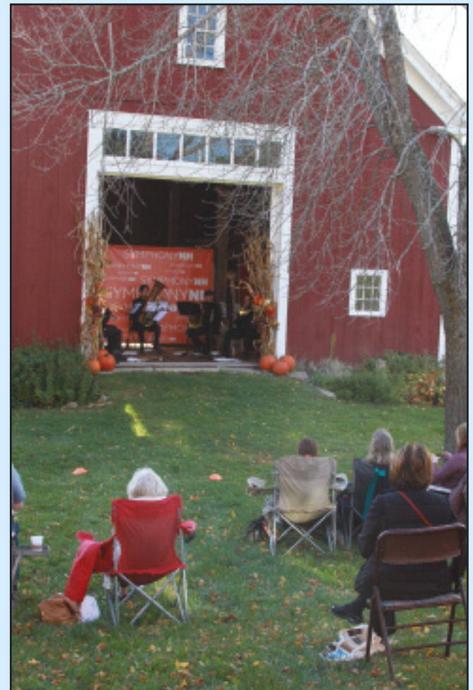
The Londonderry Historical Society had a Symphony NH brass quintet on their grounds on Saturday afternoon to offer an afternoon of music surrounded by the history of Londonderry and apple picking. The concert featured the quintet performing several songs that were written throughout a number of decades of American eras.