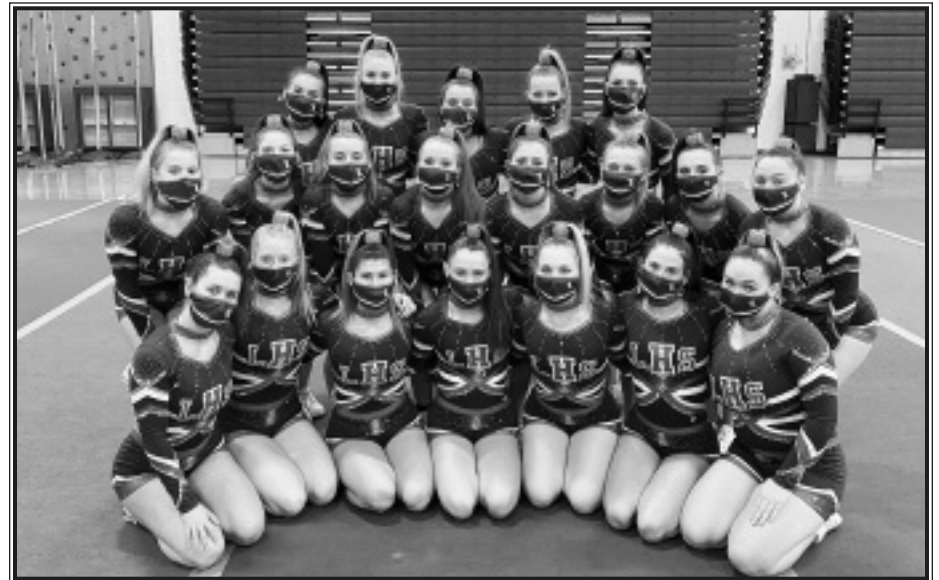
Lancer Varsity and Junior Varsity Spirit Squad members performed but didn't compete at the event they hosted over the weekend.

Judges at the event scored each team virtual-