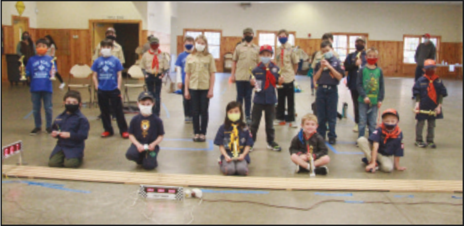
Pack 901 Scouts pose after the Pinewood Derby at Camp Carpenter.

Racers were divided into three groups, Lions and Tigers; Wolves and Bears; and Webelos and