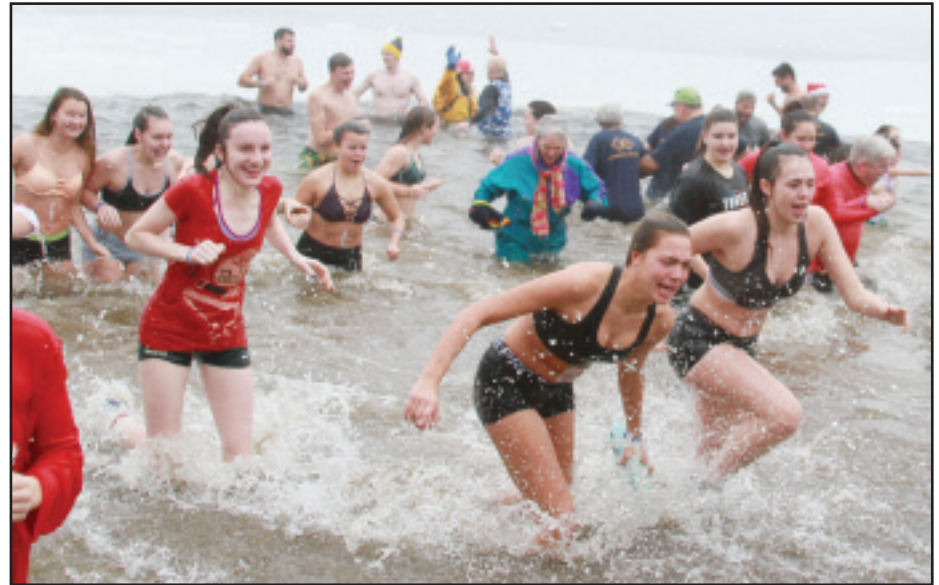
Dozens of local groups chose to take a quick dip in the chilly water at Beaver Lake to raise funds for the Derry FBC Food Pantry last year.

They added, "We are working hard to raise as much as we can, so that none of our neighbors will go hungry this coming year. Clearly, the demands on the Food Pantry this year are especially high. The need is especially great. And we are especially determined to rally our community to make this event especially successful! We invite you to join us! Form a team or