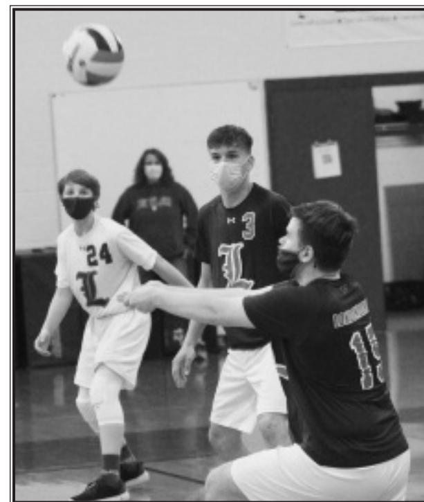
The Lancer Volleyball squad fell to Pinkerton in the home opener.

crew will now have plenty of time to get ready for their next match, which is scheduled to take place on Wednesday, May 3 against the Timberlane Regional High School Owls.