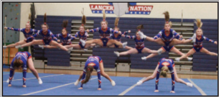
The Lancer JV Spirit squad, left, took first, and the varsity team, above, took second at their first competition over the weekend.

ultimately end with the NHIAA State Meets hosted by Pinkerton Academy. Last year the state meets were held virtual-