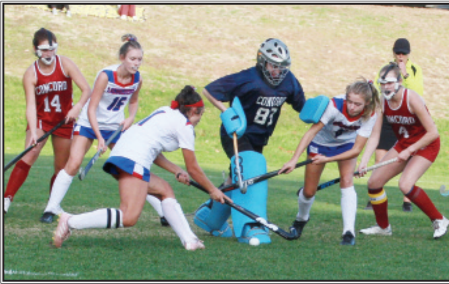
The Lancer Field Hockey team had a number of opportunities in front of the Concord goal last week.

The Crimson Tide finished the season at 11-5 and entered the NHIAA tournament as the number six seed.