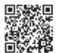
DOWNLOAD OUR APP