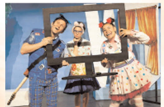
PETE THE CAT TUESDAY, NOVEMBER 8 TH